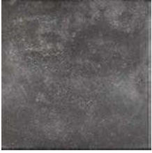
Salt Lake Winter | V4

Sizes SKU Finishes Places Of use 20X20 202722E MAT BOLD RE FA