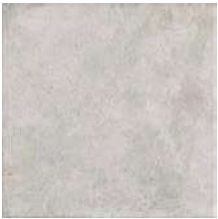
Salt Lake Spring | V4

Sizes SKU Finishes Places Of use 20X20 202811E MAT BOLD RE FA