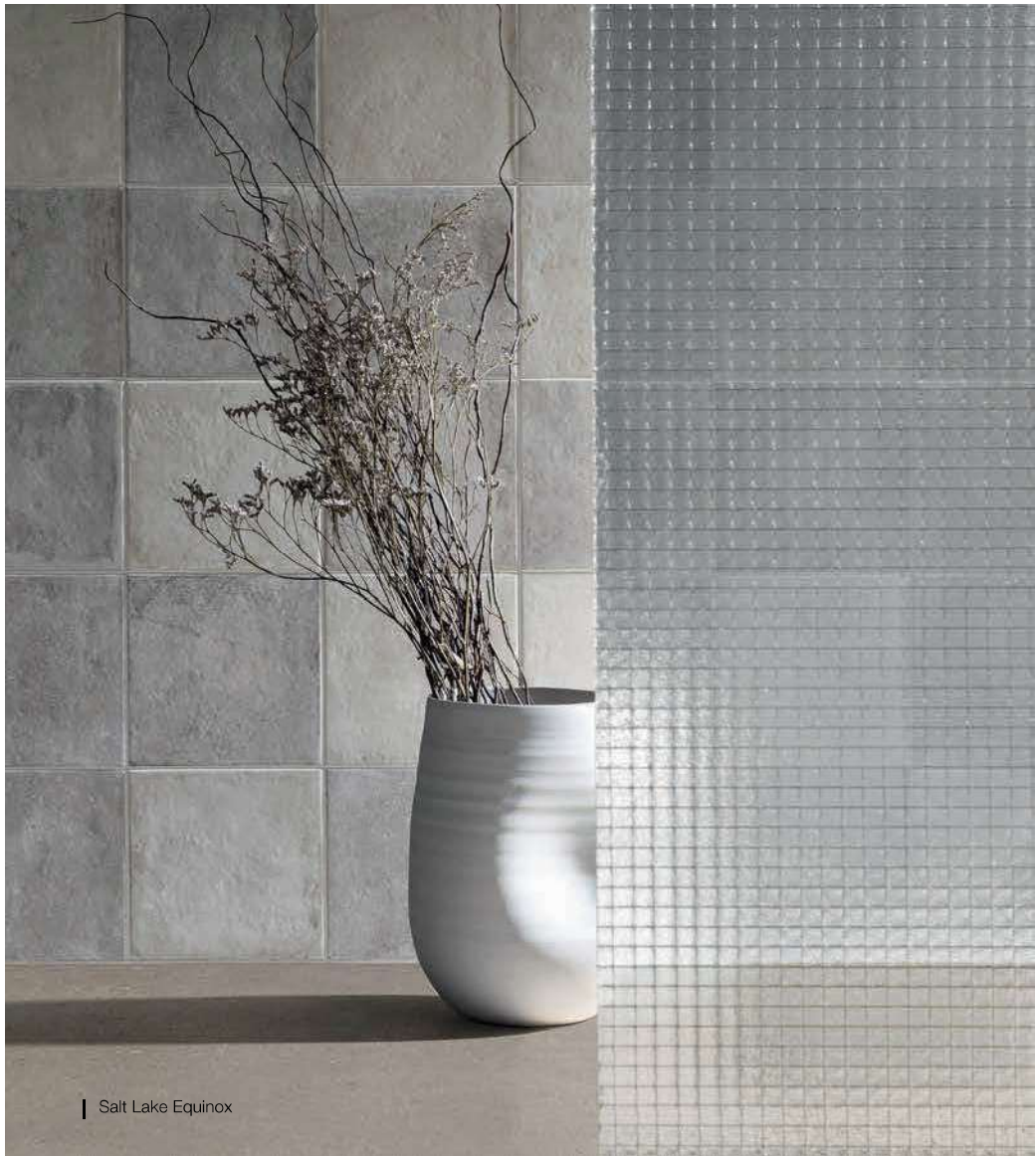
| Salt Lake Equinox