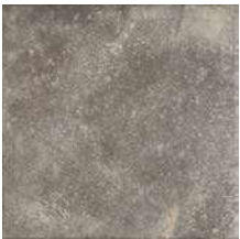
Salt Lake Autumn | V4

Sizes SKU Finishes Places Of use 20X20 202718E MAT BOLD RE FA