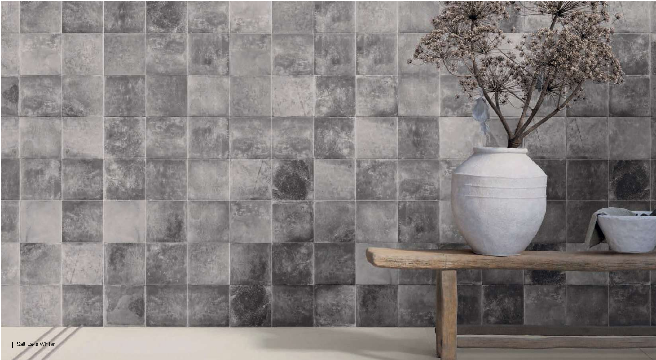
| Salt Lake Winter