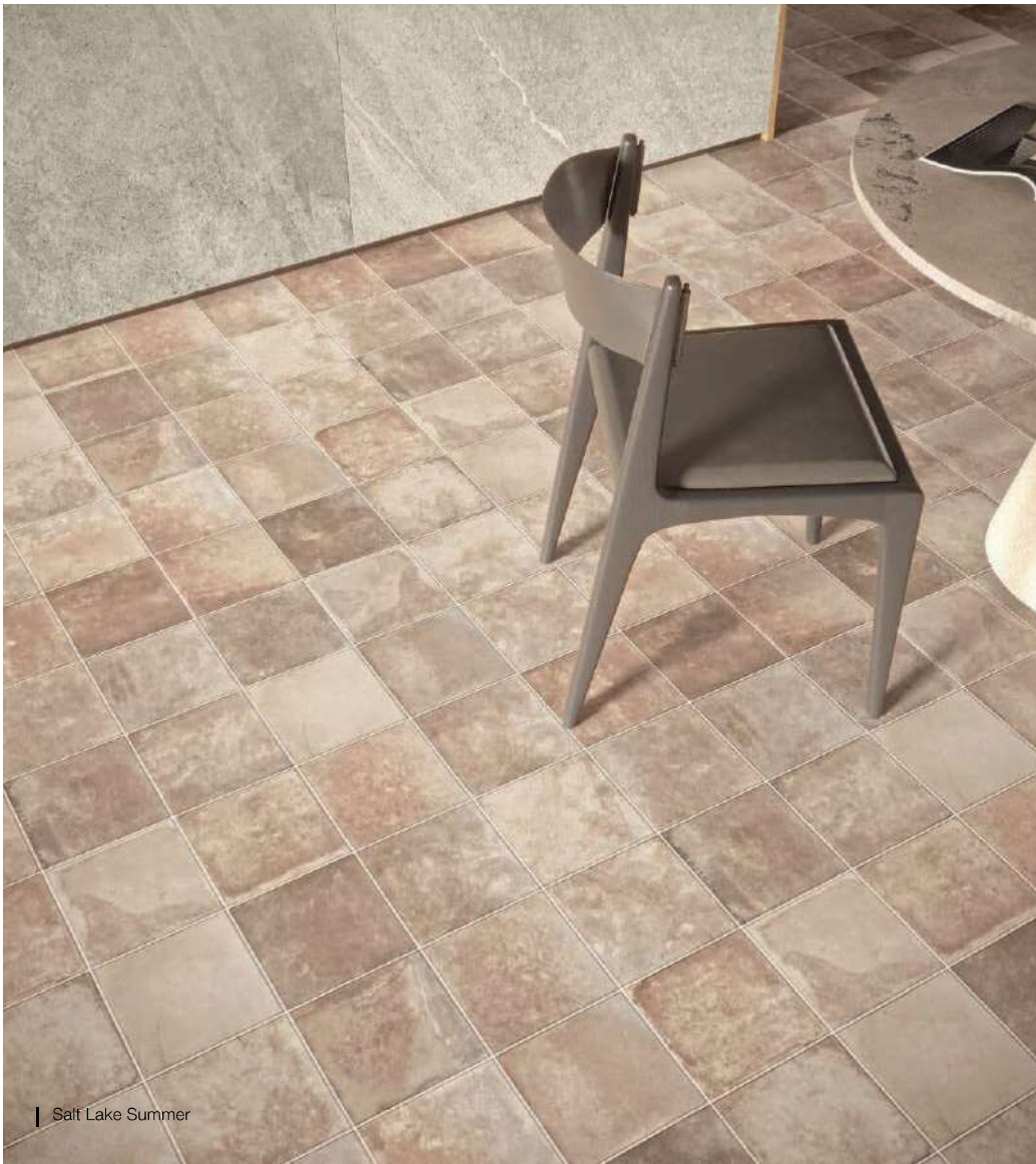
| Salt Lake Summer