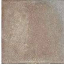
Salt Lake Summer | V4

Sizes SKU Finishes Places Of use 20X20 202722E MAT BOLD RE FA