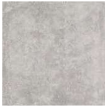
Salt Lake Equinox | V4

Sizes SKU Finishes Places Of use 20X20 202715E MAT BOLD RE FA